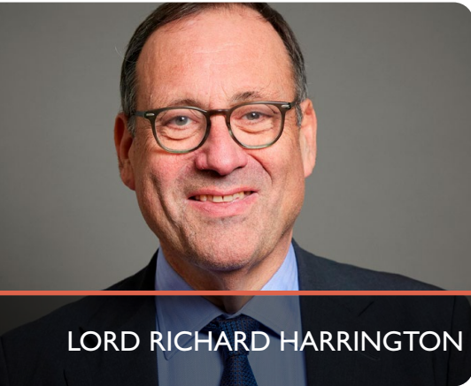
LORD RICHARD HARRINGTON

Lord Richard Harrington, Baron Harrington of Watford, has worn many hats throughout his career: businessman, politician, charity leader, advisor. His journey from successful real estate entrepreneur to influential politician and trusted advisor offers valuable lessons for business leaders considering life after retirement, or a change in focus.